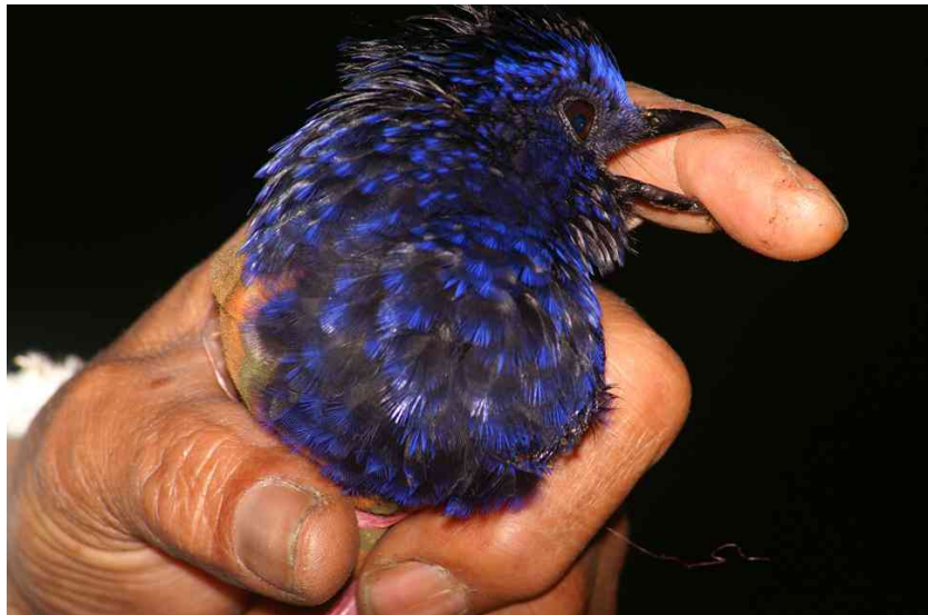
An 'ungrateful' Shiny Whistling Thrush Myophonus melanurus (endemic) biting its rescuer!

It was already dusk when we started to move into the forest. The concrete structure on the right side of the 'entrance arch' still stands, while on the left, only the foundations were visible. Right at the 'entrance arch', we heard and then saw a Pygmy Wren-Babbler skulking among the undergrowth. The trail was dark as it was under forest cover. A