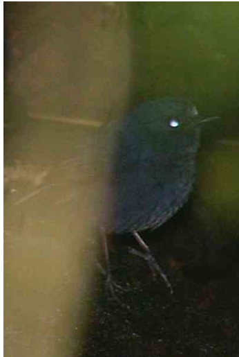
Sunda Blue Robin