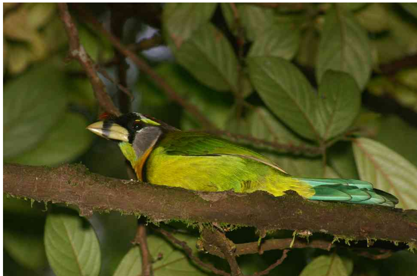
Fire-tufted Barbet Psilopogon pyrolophus Quite common at Kerinci.