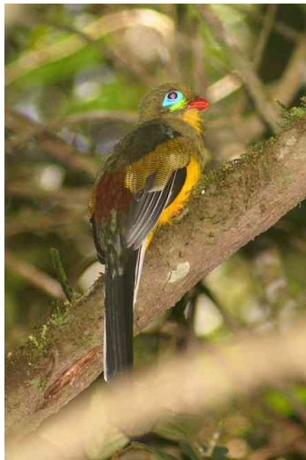
Sumatran Trogon Apalharpactes mackloti (endemic) The maroon rump distinguishes it from the Javan Trogon.

Day 2 Weather: Good initially, Rain in late afternoon.