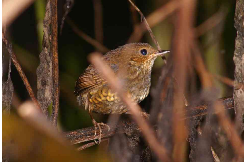
Pygmy Wren-Babbler Pnoepyga pusilla skulking among the thickets.

Once we got out of the forest, we called for transport and soon we were back at the homestay. The homestay is located at around 1500m above sea level, which made it rather cold at night. I had read of accounts of having to experience invigorating cold showers at the homestay and was grateful that our host brought us each a pail of hot water, which we could mix with cold water so that we could have a warm shower – a very welcome proposition indeed! We were suitably refreshed and a warm dinner prepared by Subandi's wife ensued.