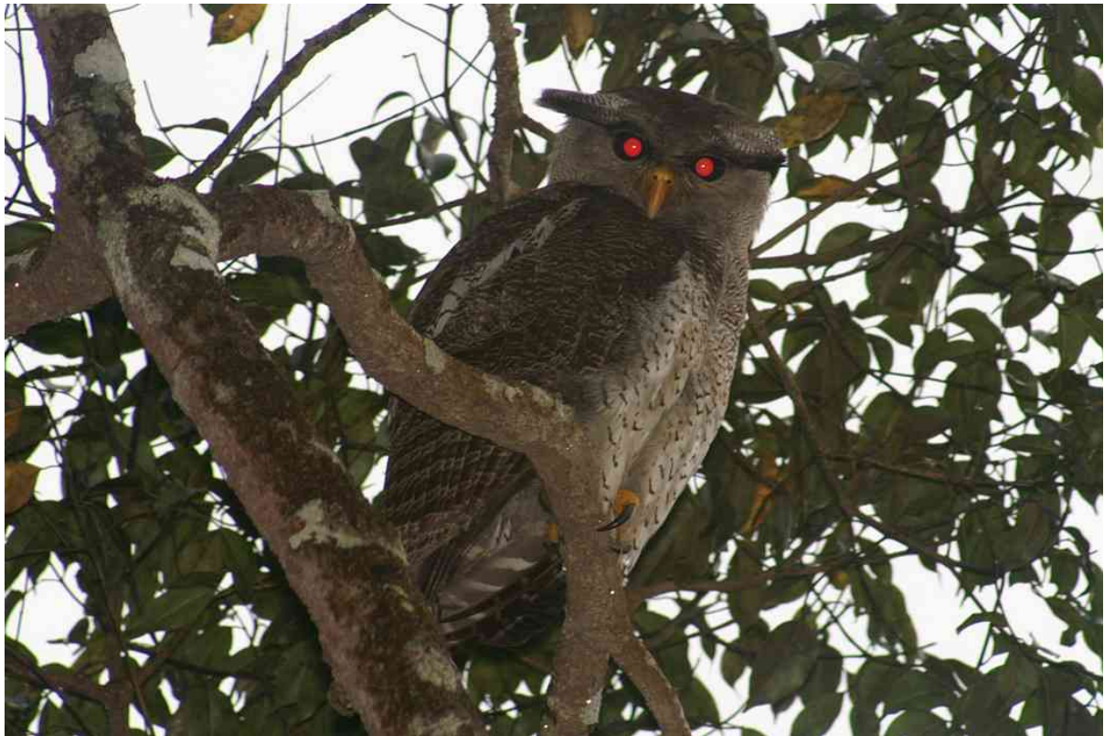
Barred Eagle Owl Bubo sumatranus at a reliable stakeout.

It was 4 plus in the afternoon and amazingly this owl was calling at regular intervals! Even so, it was not that easy to locate. We crossed the dry riverbed and bashed through quite a bit of forest before Subandi located the calling bird, almost right above our heads – a Barred Eagle Owl , a lifer for me. It was an amazing sight to behold – a large, majestic owl in broad daylight. Sure enough it noticed our presence but it just perched there! We spent 30 minutes admiring and photographing it, during which, this individual continued to call! When we left, the owl coolly turned its head to watch us leave, as if to bid us goodbye!