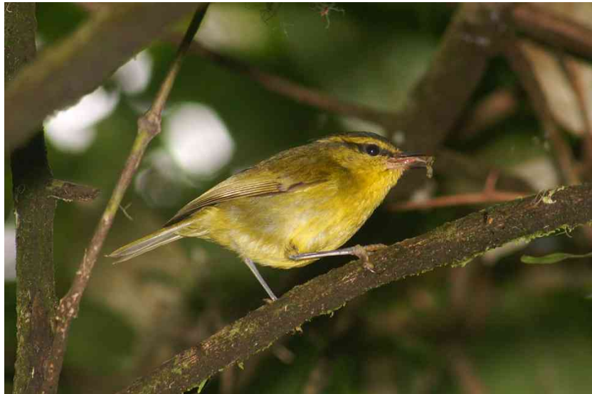
Mountain Leaf-Warbler Phylloscopus trivirgatus A hyperactive bird frozen in time.

The Burnt Tree was unmistakable. Around the Burnt Tree and slightly beyond, some birds would be seen flying, but views were too brief. Simon saw a Greater Yellow-nape and Wedge-tailed Pigeon while Subandi thought he saw a Long-tailed Sibia.