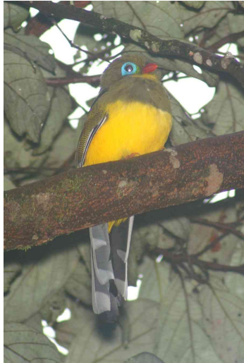
Sumatran Trogon Apalharpactes mackloti (endemic) A split from Blue-tailed Trogon.